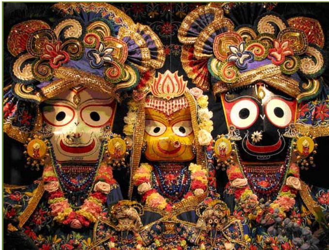
Lord Jagannath, Balabhadra and Subhadra – the three deities of the temple Lord Jagannath

to different deities and started walking towards the main temple of the Lord. But alas, upon reaching there he found that the main temple was closed. When he enquired from one of the priests, he was told that the temple will remain closed for many hours due to a special worship.